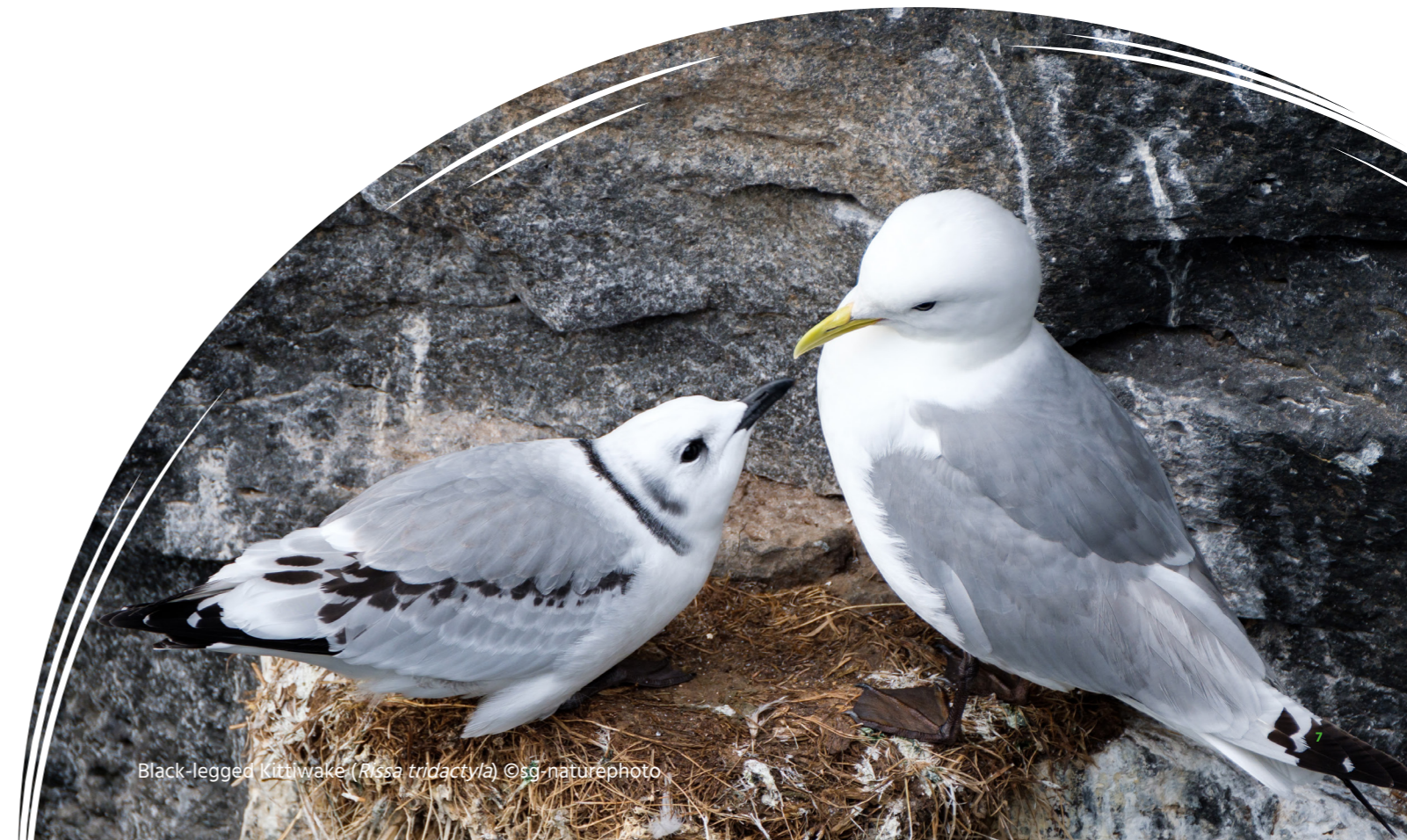
Black-legged Kittiwake ( Rissa tridactyla)

Whilst delivering a Nature Positive energy transition may require new policies, strategies or regulations, these must remain strictly within current legal frameworks for nature protection (i.e., compliant with the Birds and Habitats Directives for EU Member States); any legal deregulation is unacceptable.